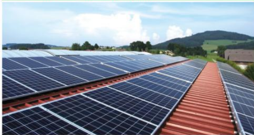
Trapezoidal Folding Roof