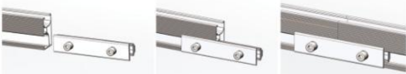
● AR Rail Installation